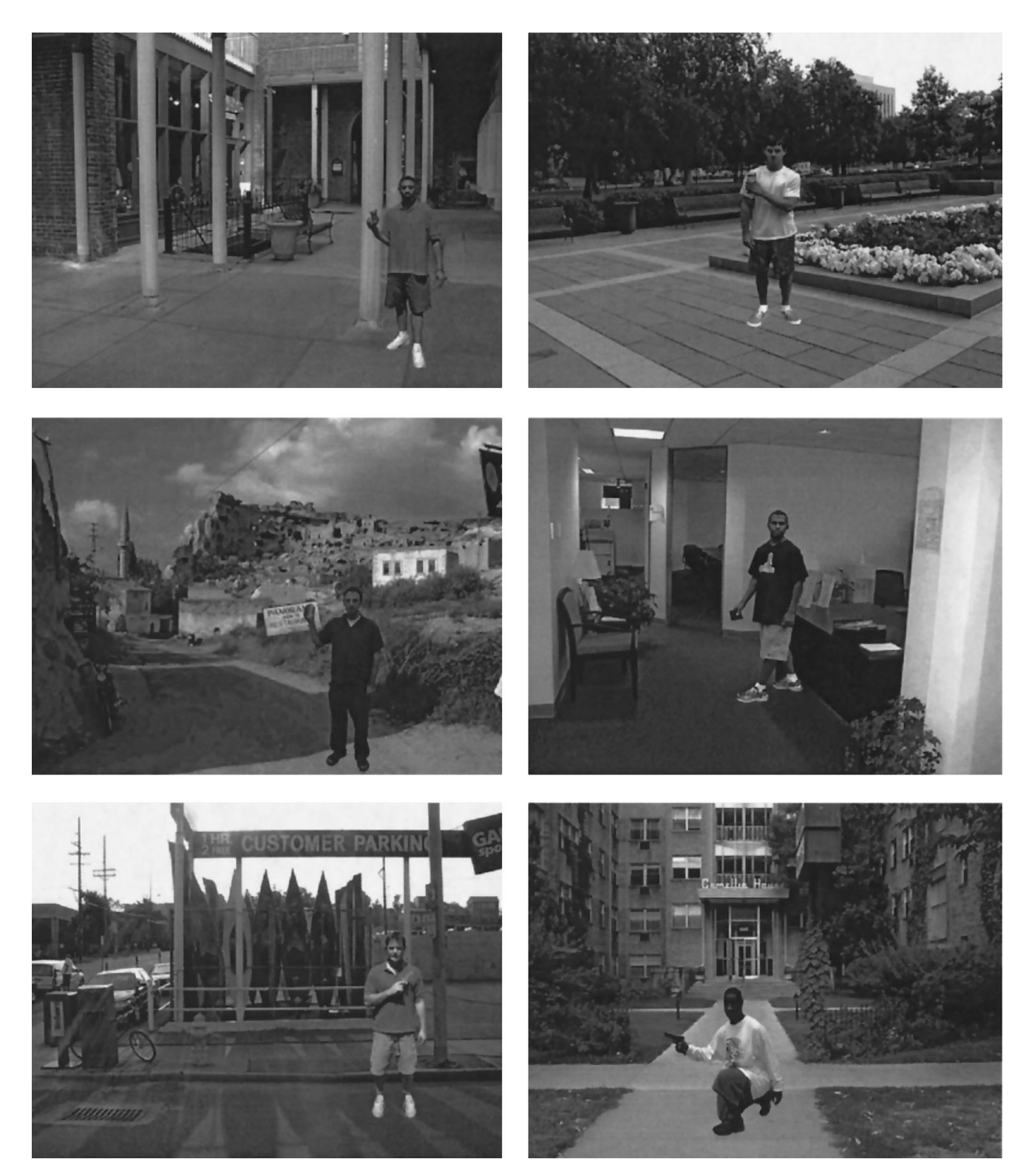
Figure 1. Target and background example scenes from videogame. Color originals are available at psych.colorado.edu/~jcorrell/tpod.html

the man posed an imminent danger, and the participant needed to shoot him as quickly as possible by pushing the right button, labeled shoot , on a button box. If he was holding some object other than a gun, he posed no